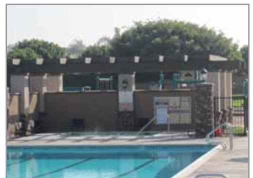
The new Niguel Shores Spa

on December 30 of the previous year. It has been a much appreciated addition to our amenities. February was a big month for the