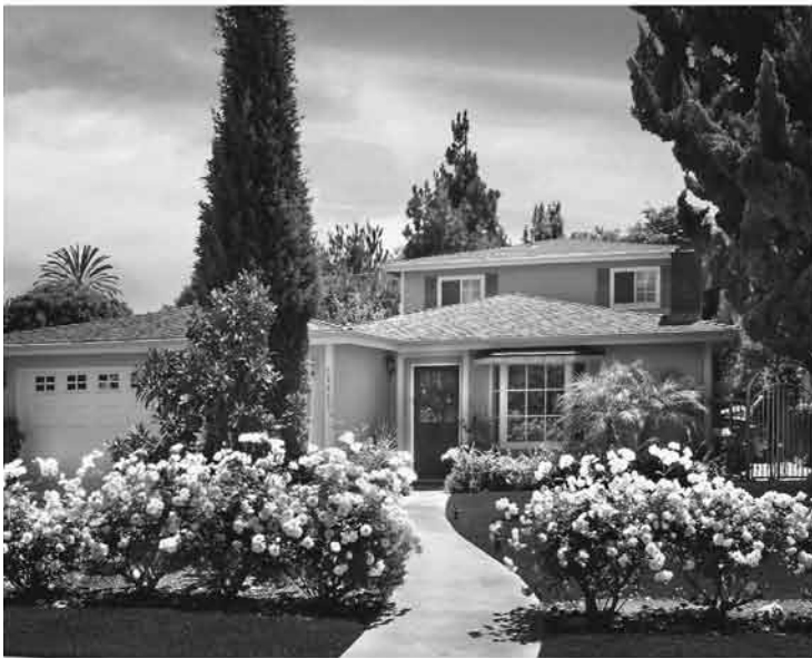
[ Dana Point - In Escrow ]