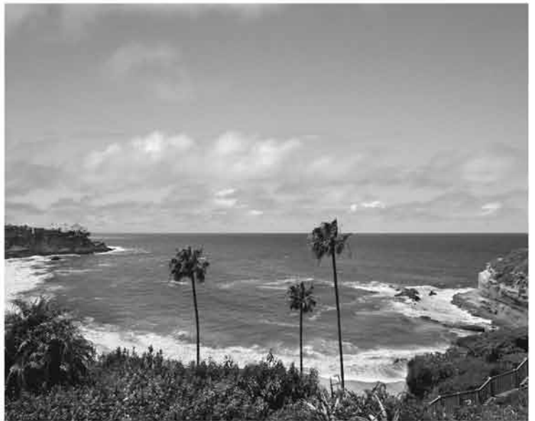
[ Laguna Beach - Just Sold ]