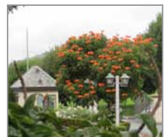
Tulip Tree on Mariner Drive