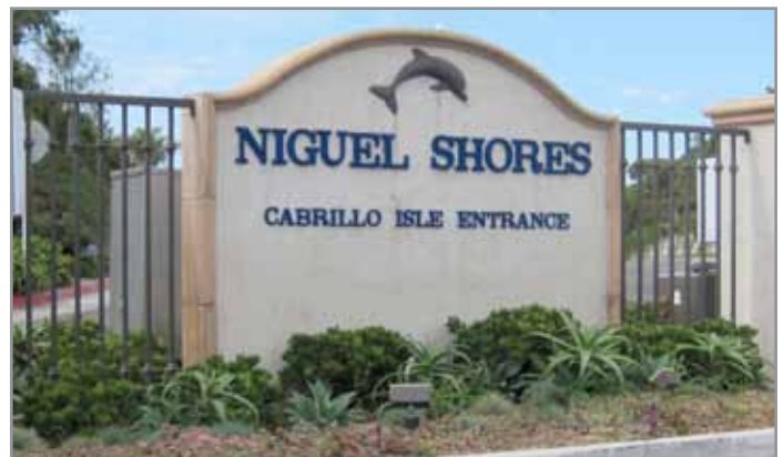
Cabrillo entrance with new drought tolerant plants.

In 2009 the Board of Directors formed a committee with the assignment to research and develop a master landscape plan for the Niguel Shores community. The shock of the recent $60,000 price increase in the cost of water, wreaking havoc* with the budget, was a wake-up call to action on the landscape front and to the need to make changes to the irrigation system which, even though the most modern satellite irrigation system was installed four years ago, is still using old sprinkler head technology. The Committee quickly took steps to submit a Request for Proposal to a number of landscape design firms which subsequently elicited presentations by three companies. From this group, SilverWood Landscape Design was engaged based on its practical and applicable proposal. The basic request for proposals was a broad one encompassing not only the plantings and irrigation