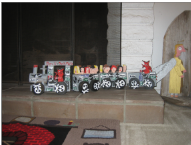
Don't get on this Devil Train—it has bad things like alcohol and drugs and will lead you to ruin.