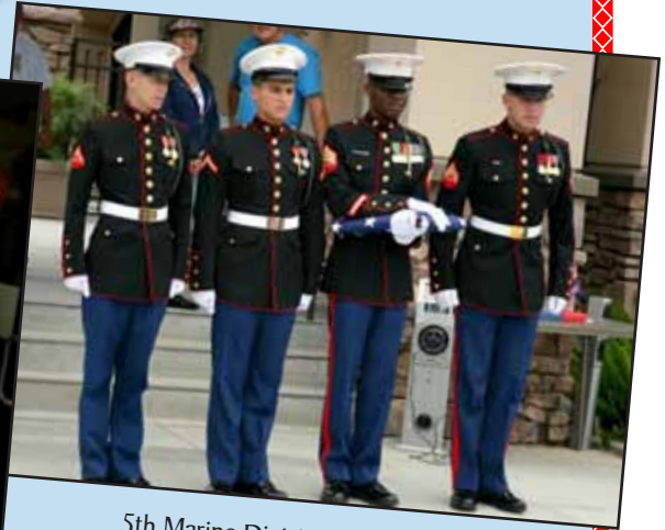
5th Marine Division Color Guard