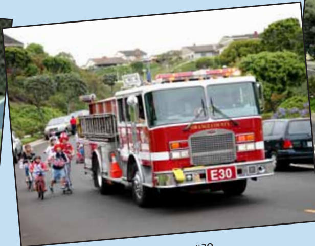
O.C. Engine #30