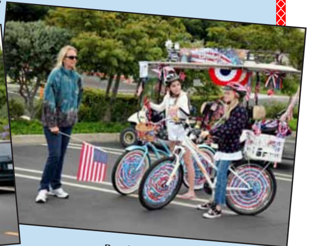
Ready to Go