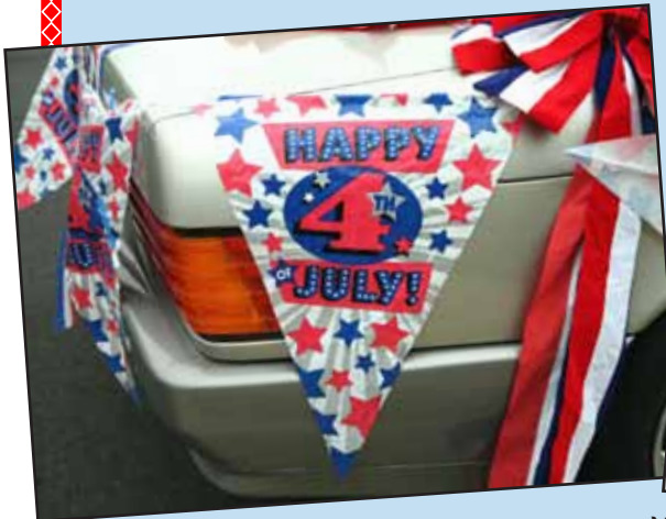
Decorated Parade Car