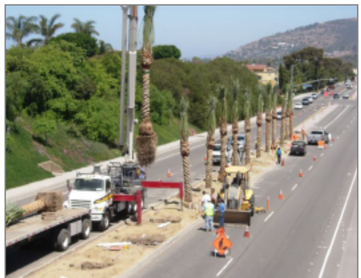
A view from the bridge: June 6, 2008.