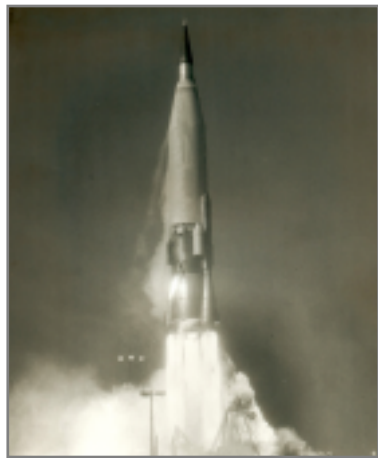
Launch of an Atlas Ballistic Missile