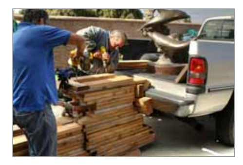
Maintenance at work on the lifting mechanism. Floor jack and lumber brings statue to truck bed height.