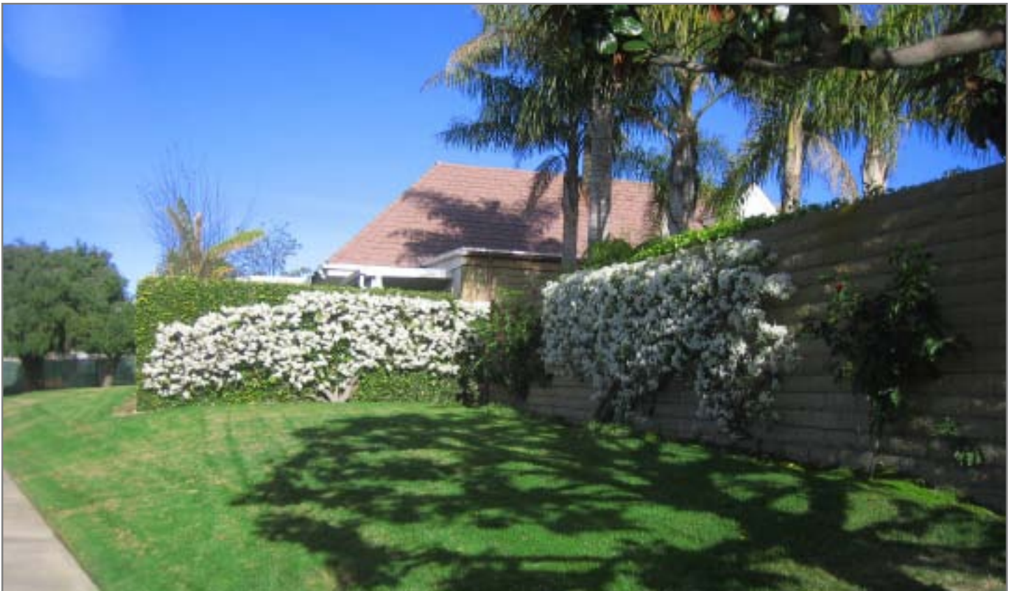
Espaliered flowering pears—an ephemeral beauty spot in Niguel Shores.