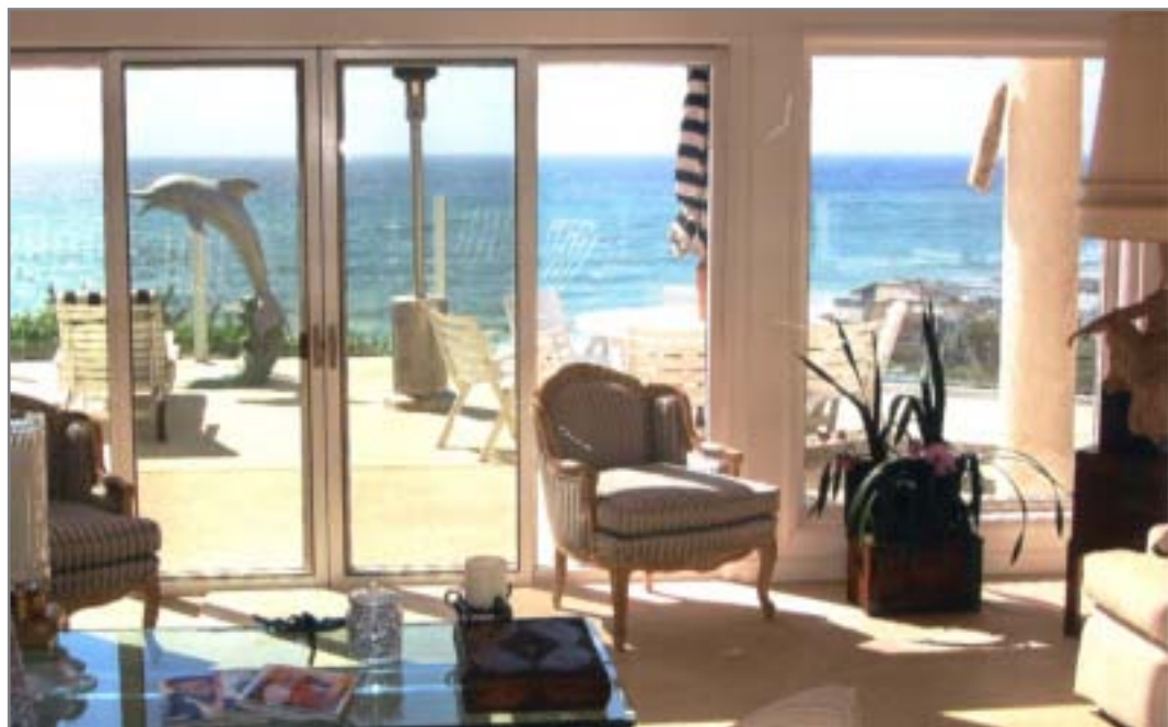
Recent Home Tour photo courtesy of Aileen Brazeau