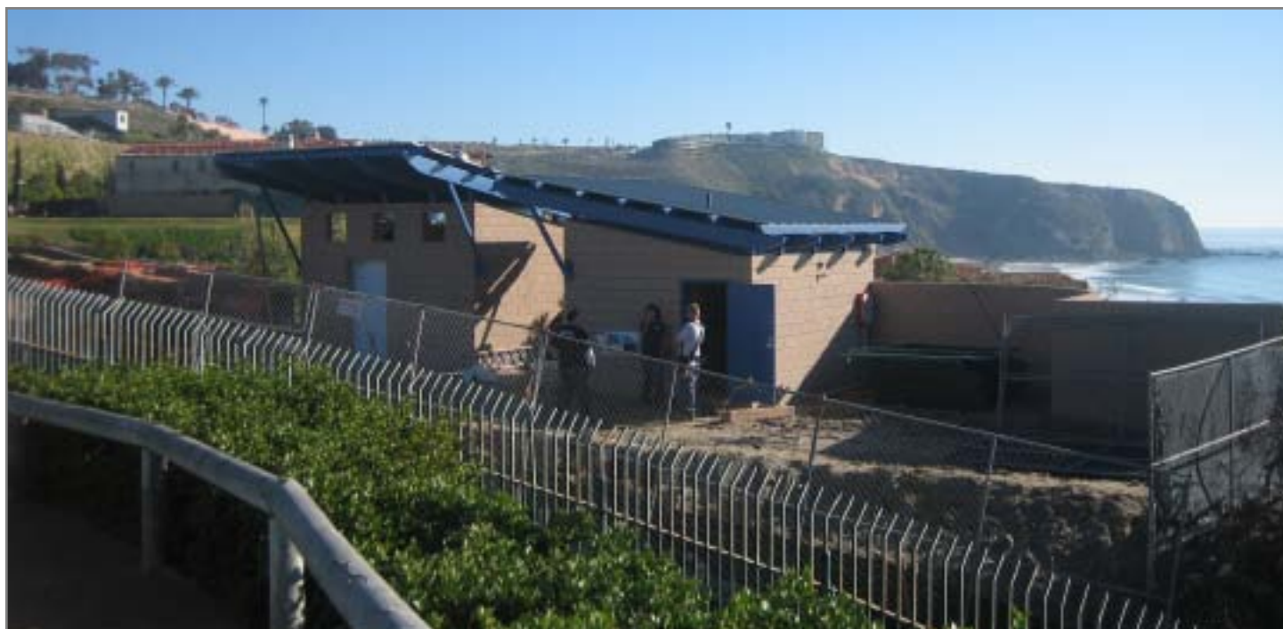
View from the Beach Bluff Park March 2009