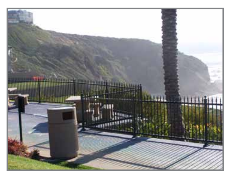
View of Headlands from Strand Vista Park

I have highlighted above the features of the three, now city owned, public parks. There is another preserved area of the Headlands that needs to be mentioned here. This area is called the Dana Point Preserve and covers the whole promontory point of the Headlands. This land was purchased by the Center for Natural Lands Management who own and manage this preserve and is open to the public also. This preserve is located at the west end of Green Lantern road. There is a new nature interpretive center at the entrance that will be run by the city. This preserve is a sensitive nature area with several endangered species on site so dogs will not be allow on the nature trail.