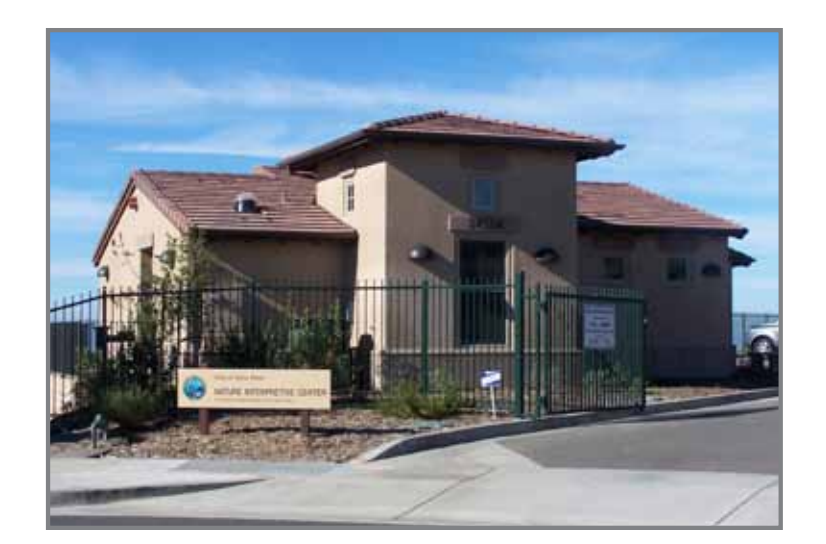
Dana Point Nature Interpretative Center

As was previously reported in this newsletter, the publishing of our monthly newsletter must, like all our community services and activities, be cognizant of its cost to the community. You saw in the January 2010 issue that we reduced the number of pages, as a cost savings, from 20 to 16 pages. This page reduction was partly accomplished by using an