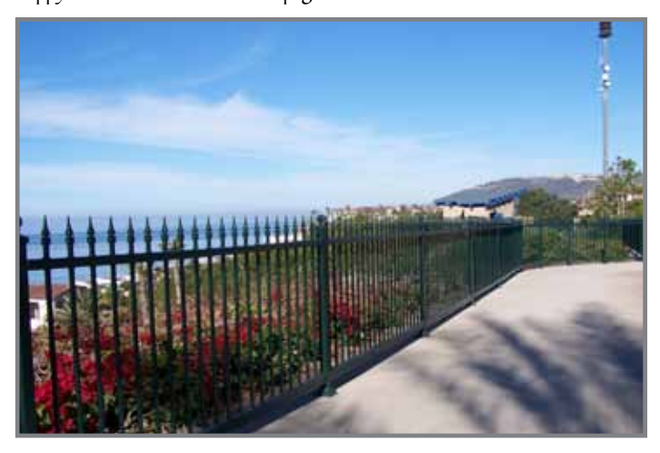
Strand Vista Park Walkway

is located on the western edge of the Strand Beach county parking lot. It runs along the top of the bluff overlooking the Highlands development and offers a spectacular panorama view of the Pacific ocean. A colorful walkway leads from the north end of the park, beginning at the Funicular elevator, to the south end that ends at a Veterans Memorial Plaza.