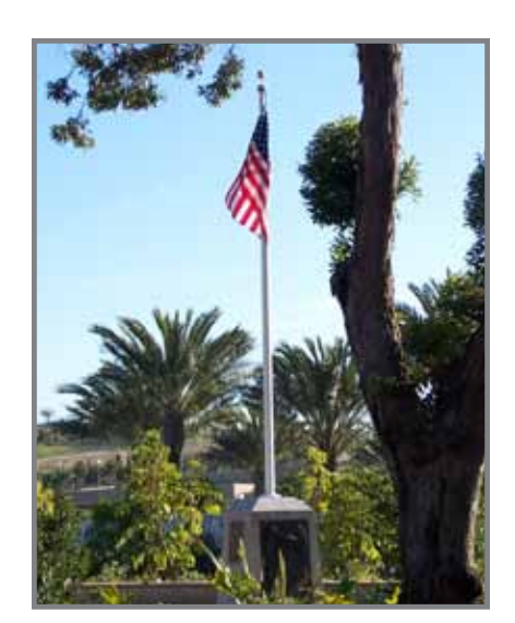
Veterans Memorial Plaza

There were two additional areas in the Headlands that were developed as parks. The first in called the Hilltop park which sits, as the name says, on the highest part of the Headlands. The second park is called the Harbor Point Park and is located on the west side of Green Lantern road.