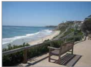
Beach Bluff Park for BBQs, tacos and concerts

Beach Bluff BBQ: May 29. Need a Pit Master (help with the grill). Time 5:00 to 8:00 p.m. Open for everyone to bring their own meals and friends as you enjoy the BBQ and sunset.