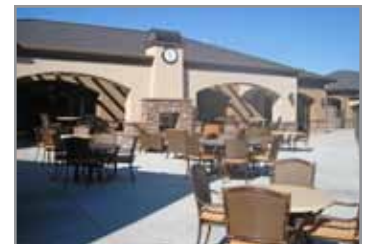
ClubHouse Patio for St. Patrick's Day & Potlucks inside

Thursday, February 17, 11:30 a.m. to 1:30 p.m. One Pot Meals. Come learn and enjoy the tasting of short ribs