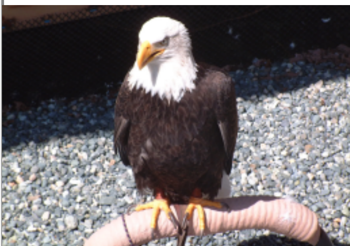
Winning photo by Bernie Fornadley — see page 12 for article.