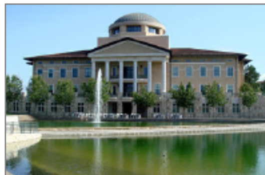
Soka University Founders Hall.