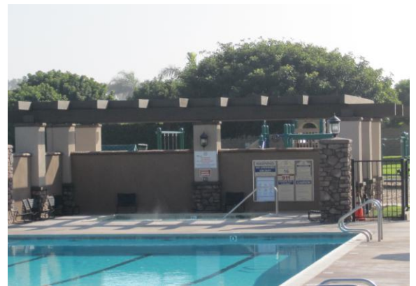
New Spa - 2009