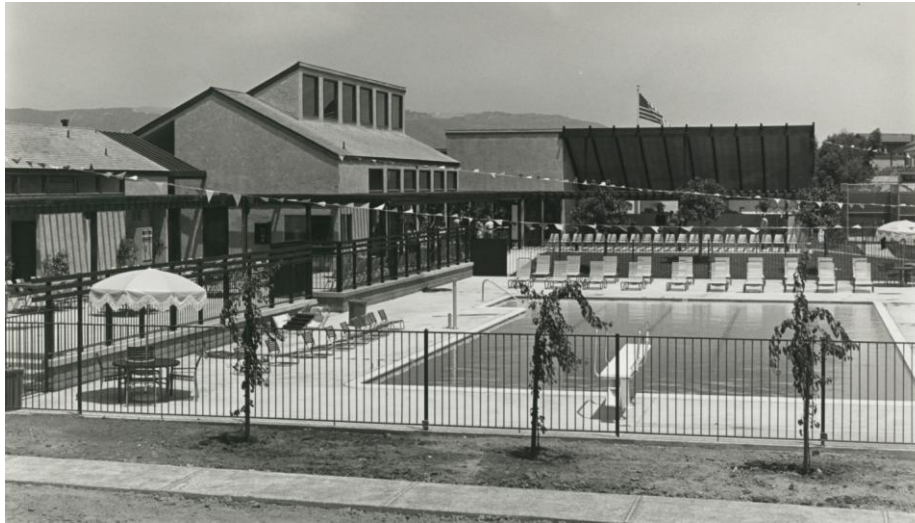
Original Community Center & pool completed in 1973