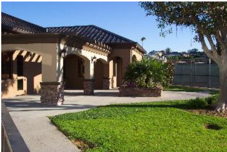
Rear view of the new Niguel Shores office building – 2007

Niguel Shores was originally part of Laguna Niguel until the incorporation of Dana Point in 1989 when the Monarch Beach area voted to join Dana Point rather than Laguna Niguel. The area had been called the “Coastal Strip” until a vote was solicited of the local residents to choose a new name. They considered Monarch Bay, Salt Creek Beach and Monarch Beach and chose the latter.