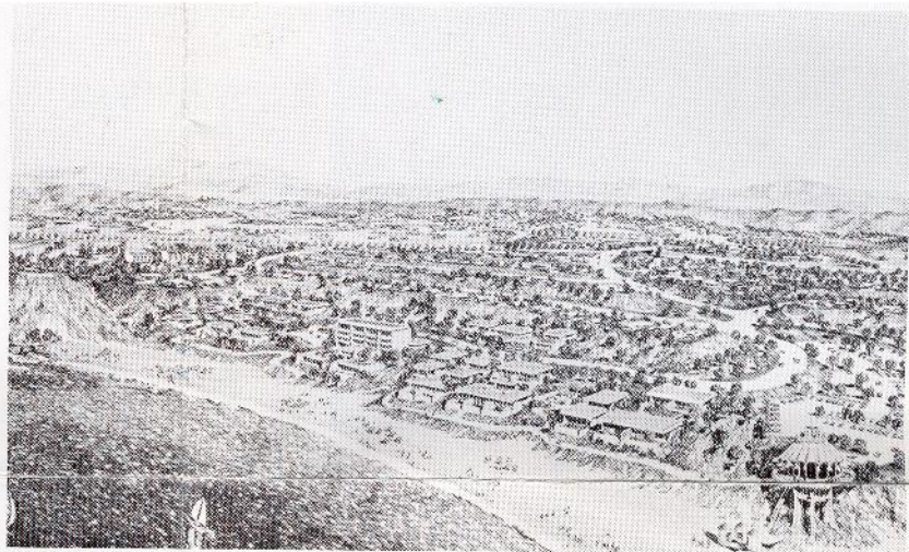
Niguel Shores—Ocean view homes and homesites, together with a prestigious condominium, will grace this rare beach frontage. Such development enhances values throughout Laguna Niguel.

On March 24, 1970 Richard B. Smith, Inc. filed a subdivision report on Tract No. 6935 in Niguel Shores, known as the Broadmoor Homes. These homes on Windjammer, Brigantine and Windlass were the first homes built