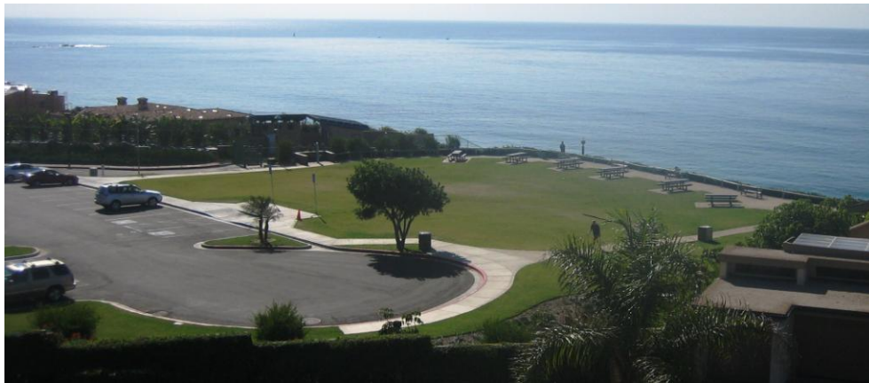
Expanded Beach Bluff Park - 2009

At the same time, the Beach Bluff Park was regraded and expanded with new turf, landscaping and furniture. The bluff parking lot, too, was improved with new retaining walls, resurfacing and landscaping, all completed in June, 2009. A new and expanded spa was installed as part of the general improvement of the Community Center and was officially opened for residents' use on December 30.