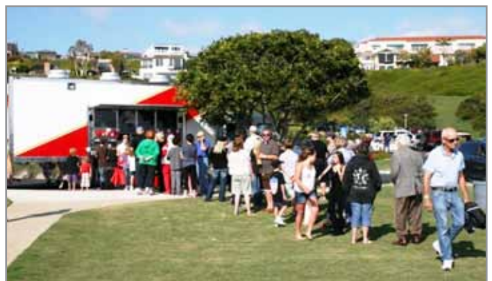
Long line for an In-N-Out Burger refreshments

October 1: A Chili Cook-off Beer Garden Feast — 4:00 to 7:00 p.m. A chili cook off contest: forms are in office. To enter make two crock pots of your favorite chili. There will be judges from local restaurants. Come