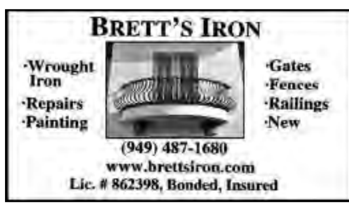
NSCA is not responsible for any work done nor are we recommending any of the advertised companies

December offers fun for Women's Club members, starting with the annual Holiday Party on Thursday, December 3 from 5–7:00 p.m. in the ClubHouse. Attendees should bring hearty appetizers for the potluck—no dips, nuts, chips or candy, please. The bar will provide wine and soft drinks. Members are