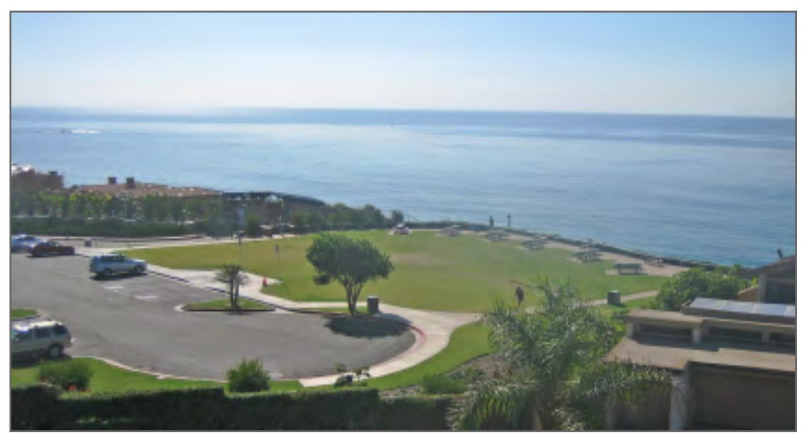
Beach Bluff Park

Number three: The newly resurfaced and re-landscaped parking lot with its sturdy retaining walls. If a parking lot can possibly be attractive, that one is. Maybe it's because it's ours. Then there is the