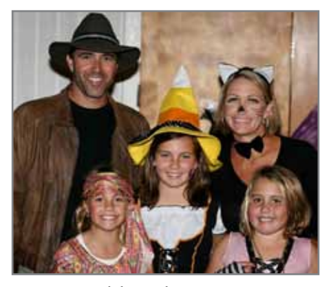
Meredith Family in Costume.

children running the booths assist them and hand out prizes. Pizza and drinks are sold from the Club-House kitchen and many gener-