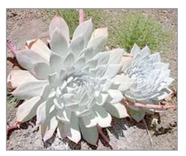
Dudle ya Succulent

Some drought tolerant plants survive periods of reduced summer water by going dormant and then resuming growth during the winter and spring. Many low-wateruse plants actually avoid drought