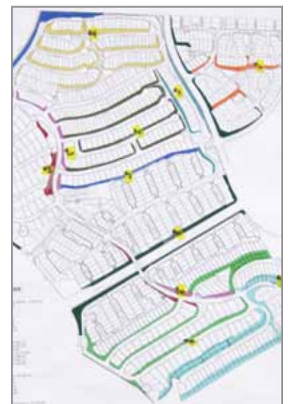
Color coded master plan of slope types