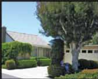
23741 MONTEGO BAY