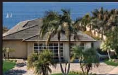
33831 NIGUEL SHORES DRIVE