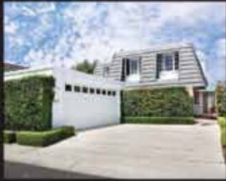
23655 TAMPICO BAY