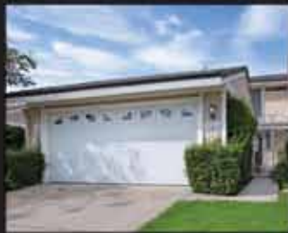
33855 MANTA COURT