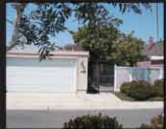
23881 CORAL BAY