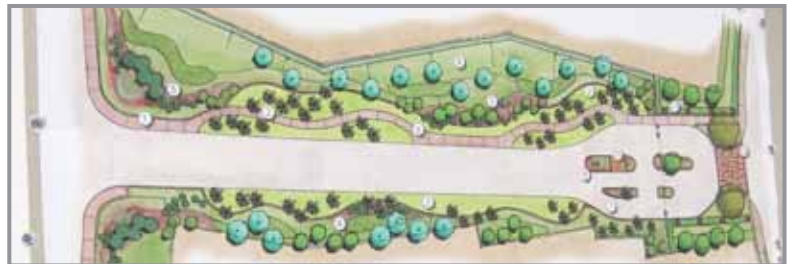
Master plan of Mariner Gate Entrance