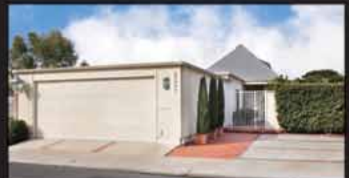
23901 TARANTO BAY