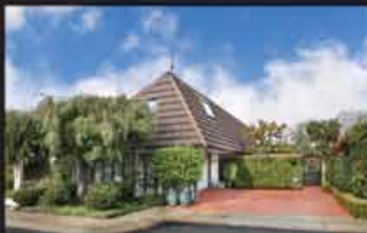
23651 TAMPICO BAY